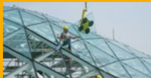
SEALING AND BONDING