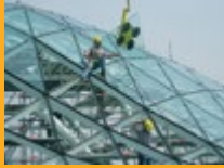
FAÇADE STRUCTURAL ADHESIVES