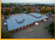
LIQUID APPLIED ROOFING