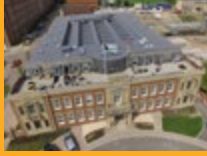
SINGLE PLY ROOFING