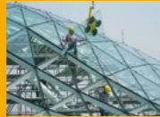
FACADE STRUCTURAL ADHESIVES