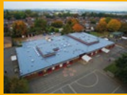
LIQUID APPLIED ROOFING