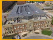
SINGLE PLY ROOFING