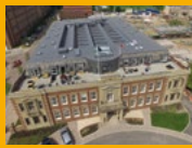
SINGLE PLY ROOFING