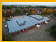
LIQUID APPLIED ROOFING