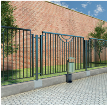
Bonding of steel.