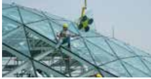
SEALING AND BONDING