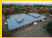
LIQUID APPLIED ROOFING