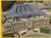
SINGLE PLY ROOFING