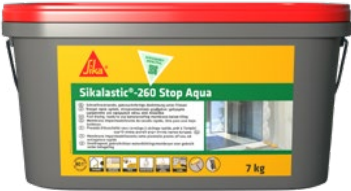
Available in 7 kg plastic pails