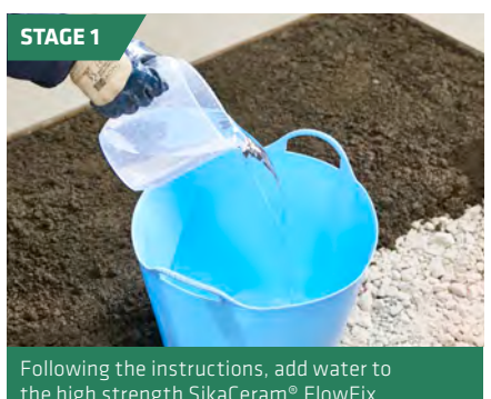
the high strength SikaCeram® FlowFix