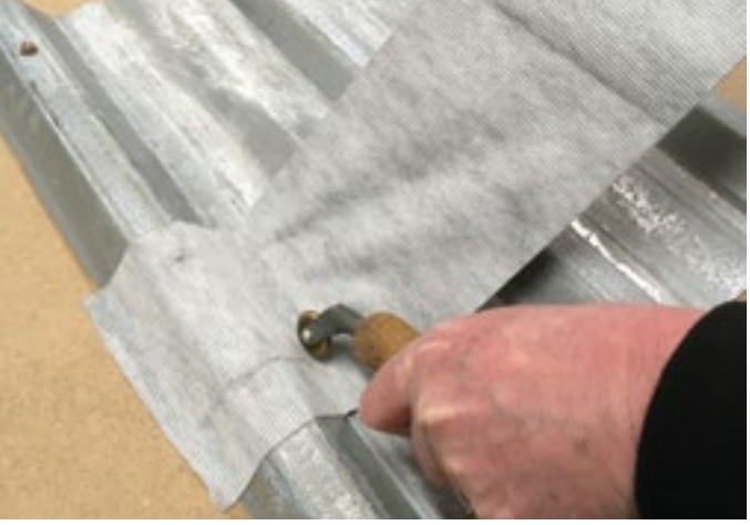
Sika® Joint Tape SA

Sika® Pro-Tecta WP is our new and enhanced waterproofing system, which has been engineered around our two flagship polyurethane membranes: Sikalastic®-625 and Sikalastic®-641 - low odour, as a low odour option.