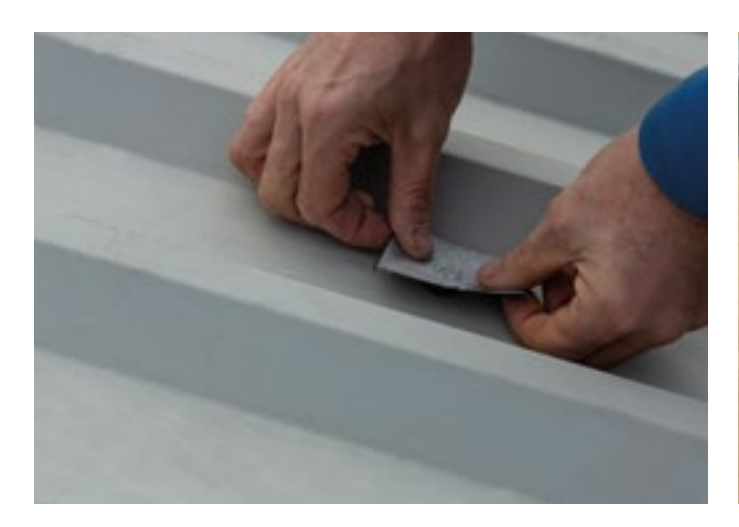
Sika® Joint Tape SA

Whilst remedial treatments such as Sika® Pro-Tecta CE will be a good choice for early maintenance, it is very often the case that metal roof systems require a more extensive refurbishment solution, particularly where sheets are damaged or leaking.