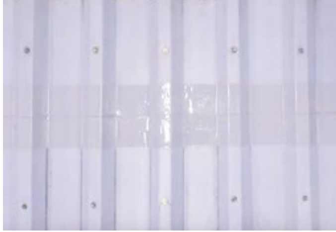
Sika® Pro-Tecta CE