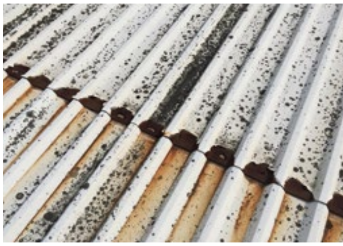
Corroded roof sheet

Sika® Pro-Tecta CE has been developed and tested as an effective surface treatment for the onset of cut edge corrosion, designed to extend service-life, where the sheets remain structurally sound, and the primary waterproofing function has not been compromised.