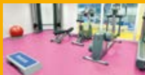
LEISURE AND RETAIL