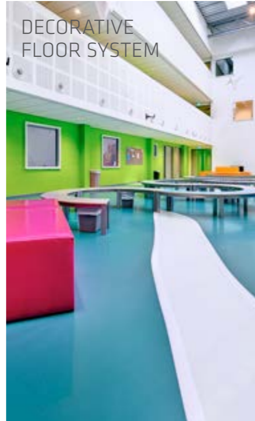
DECORATIVE FLOOR SYSTEM

With dozens of systems in countless styles, textures and colors, if you can dream it, chances are we can create it. Just tell us what you're looking for and together, we'll find the perfect, high performance flooring system for your unique needs.