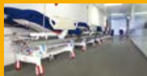
HOSPITALS AND HEALTHCARE