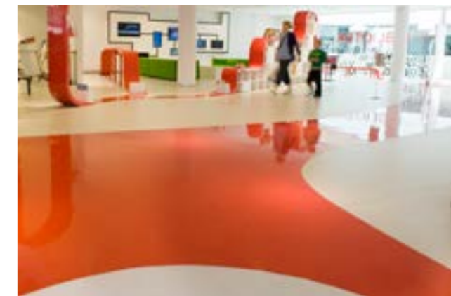
INDUSTRIAL FLOOR SYSTEM